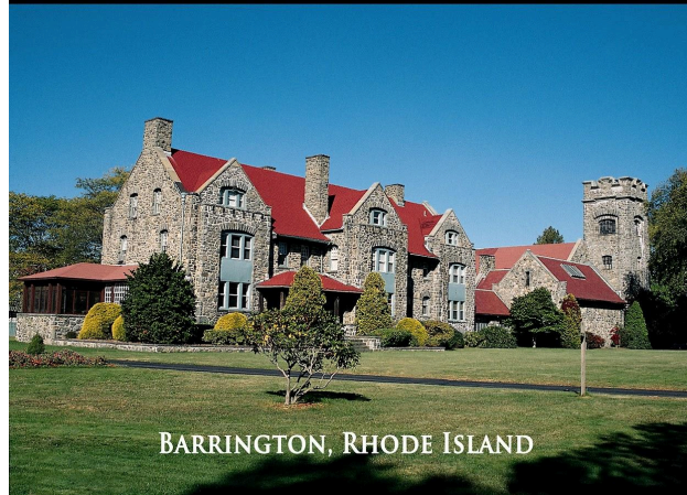
BARRINGTON, RHODE ISLAND